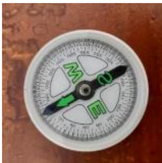
Figure 2. Compass