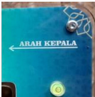
Figure 4. Head pointer