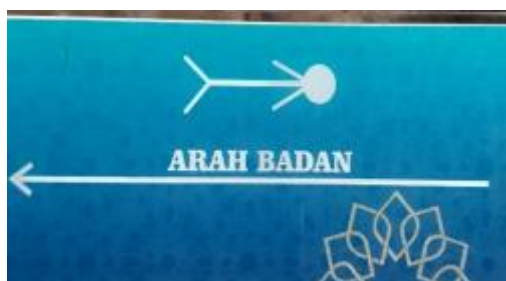
Figure 5. Body Direction

This direction indicator is located on the L-Qibla section. This section is useful for indicating the position in which the body should be laid. This device clearly shows the direction in which the feet and head of the body should be placed.