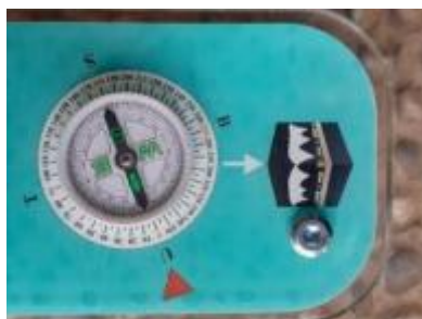
Figure 6. Qibla Direction