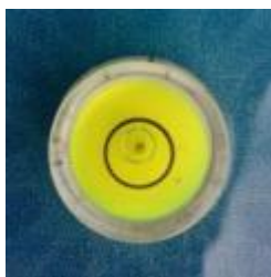
Gambar 3. Waterpass

The function of waterpass in the L-Qibla is to assist the use of the compass, ensuring that the indicated direction is more accurate. When using a compass, a spirit level is required to confirm that the surface is flat and level. The spirit level is positioned on the elbow of the L-Qibla to provide balance during tripod calibration, ensuring that the device remains in a stable and level position..