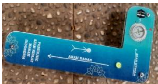
Figure 1. L-Qibla

specifically for measuring the direction of the qibla of a grave. 12 The main component of this tool is a compass, making it easier to use. The L-Qibla was created because of the issue of the direction of the qibla in graves, which is rarely or never considered by the general public and academics in the field (astronomy). 13 The fact on the ground is that most graves are not precisely aligned with the direction of Mecca. As the direction of Mecca is the main problem, this is part of the discussion of astronomy.