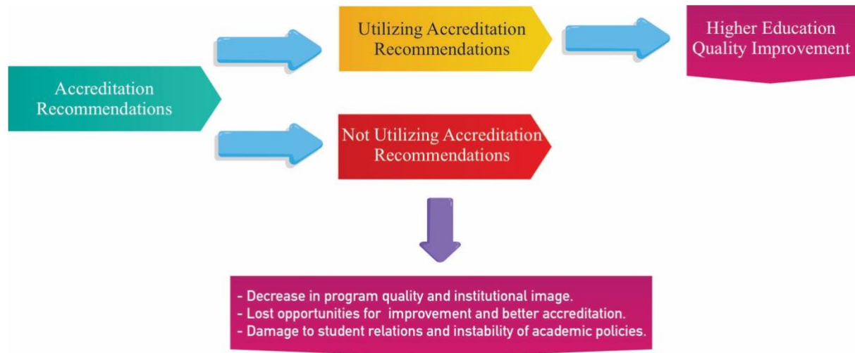
Figure 2: Novelty of Findings

This institution has the strength and opportunity to improve the quality of education and research as well as quality assurance, but is also faced with a number of challenges that must be overcome to achieve these goals. Effective evaluation and monitoring as well as collaborative efforts of all parties will be important in dealing with threats and exploiting opportunities.