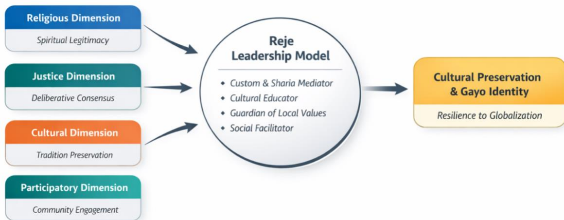
Figure 1: Reje Leadership Model

Based on the analysis, it can be concluded that the leadership model of the Reje in Kampung Keramat Mupakat represents a tangible form of customary leadership that preserves tradition while reinforcing the cultural identity of the Gayo people. This leadership is not only grounded in religious legitimacy rooted in Islamic values but also strengthens the principles of justice through deliberative consensus, safeguards cultural wisdom by preserving traditions, and prioritizes collective participation. These four dimensions position the Reje as a central figure who mediates between custom and religion, tradition and modernization, as well as leadership and communal solidarity (Husaini & Hidayat, 2019). Thus, the Reje's leadership functions not merely as a regulator of social life but also as a moral guardian, cultural symbol, and protector of Gayo identity amid the dynamics of social change (Bengi et al., 2024). This affirms that the presence of the Reje remains both relevant and strategic in ensuring that Gayo customs and culture not only endure but thrive as a dynamic expression of the community's collective identity.