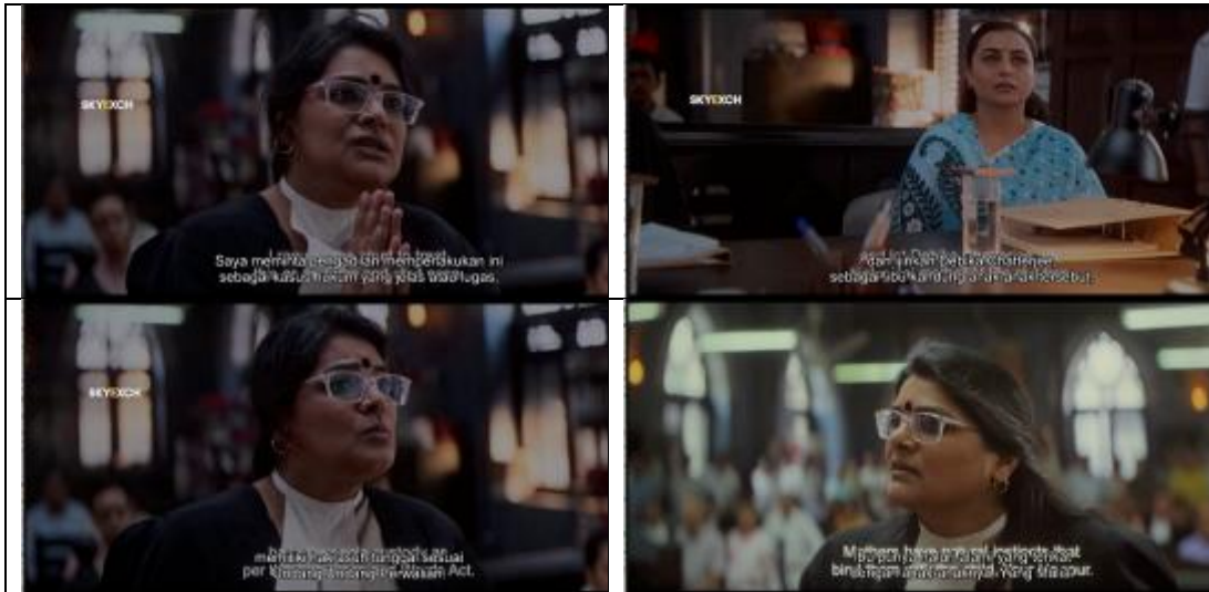
Figure 6. Debika Chatterjee's Struggle in Mrs. Chatterjee vs Norway

Debika was devastated by the incident, and she started fighting to get her children back. He tries to understand the reasons behind Barnevernet's decision and find out how he can bring his children home. On the other hand, her husband Anirudh shows indifference towards Debika's struggle. He seemed more focused on his work and did not fully support Debika's efforts. In the long and tiring legal process, Debika felt very isolated. Anirudh, her husband, tends to side with Norway's decision and prefers to accept the situation. Debika felt betrayed by her husband, who did not support her cause enough. Even her family in India doubted her abilities and began to think of her as a mother who failed to care for her children.