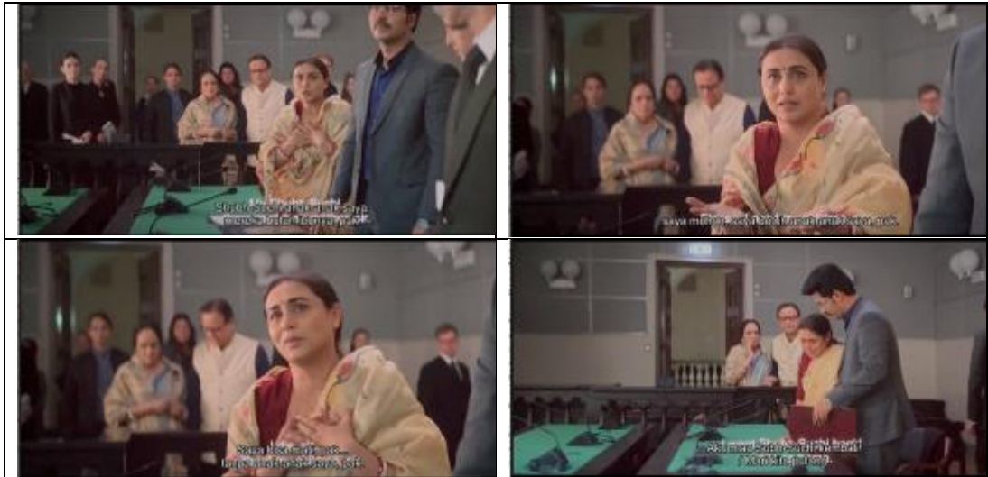
Figure 4. Debika Chatterjee’s Struggle in Mrs. Chatterjee vs Norway

Debika continues her battle in court. In court, he tried to prove that the parenting culture he implemented was part of Indian tradition and was not harmful to the children. However, the Norwegian court rejected Debika's argument because such care was contrary to the child's rights under their country's law. Apart from that, Debika also found it difficult to explain Indian culture which was not understood by the Norwegian judges and authorities.