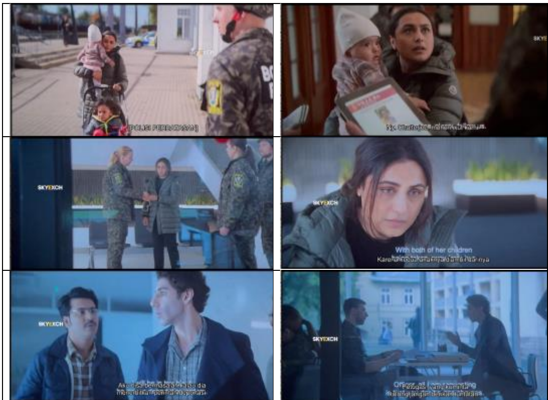
Figure 5. Debika Chatterjee’s Struggle in Mrs. Chatterjee vs Norway

Debika continues her battle in court. In court, he tried to prove that the parenting culture he implemented was part of Indian tradition and was not harmful to the children. However, the Norwegian court rejected Debika's argument because such care was contrary to the child's rights under their country's law. Apart from that, Debika also found it difficult to explain Indian culture which was not understood by the Norwegian judges and authorities.